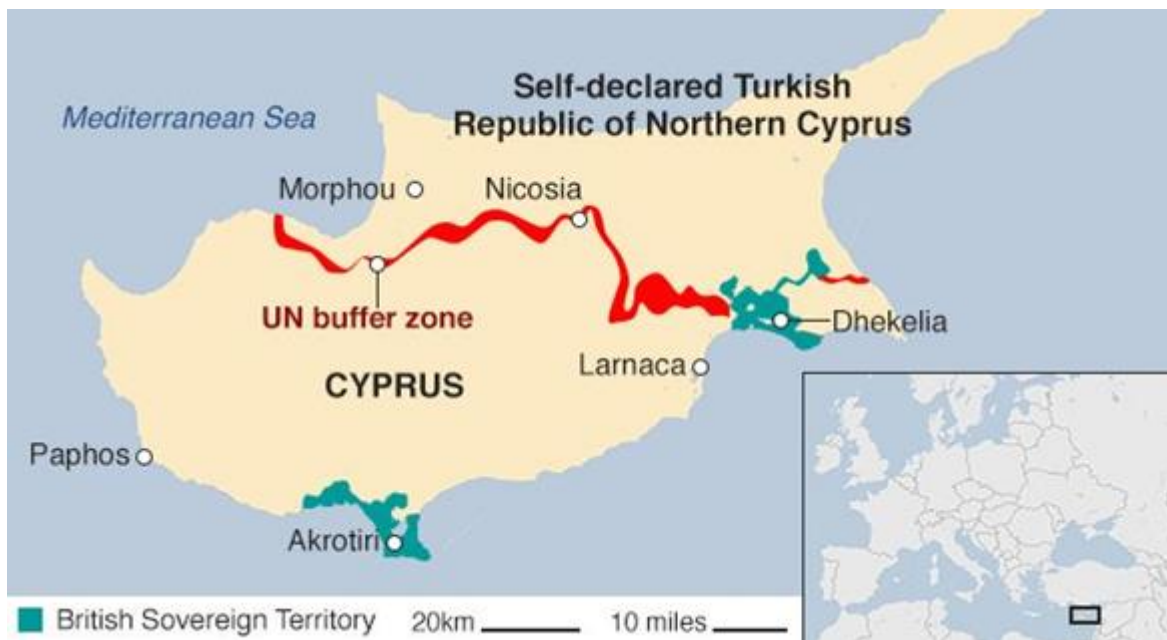
Figure 3. Geographical division of Cyprus after Turkish invasion (found at: http://www.bbc.com/news/world-europe-38593506 , the 15 th of June, 2017)

The General Assembly of UN expressed complete disapproval of the invasion of Cyprus and requested the return of Greek Cypriot refugees to their territory and homes, demanding respect of human rights of Cypriots. Eight years later, in November 1983, Turkey proclaimed an independent state called "Turkish Republic of Northern Cyprus" (see Figure 3). The International Community and Humanitarian Organizations disapproved and condemned it, as invalid and unlawful, while demanding the withdrawal of this statement. To date, this state has only been recognized by Turkey (Papadakis et al. , 2006).