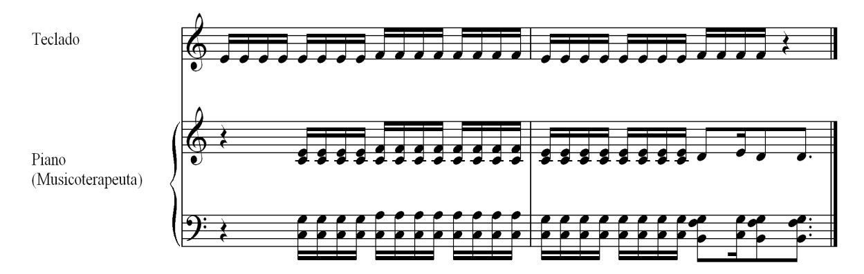
(I play in the sharp notes of the piano, therefore this fragment is played an entire eighth above)

From this xylophone intervention, the electric organ, (played by another member of the group) accelerated the semiquavers creating a new melody, a change of direction. I picked up in the piano the melody with some variation creating a more safegiving structure with the objective that the entire group entered the game. It was after creating and offering this structure when the entire group entered the musical dialogue.