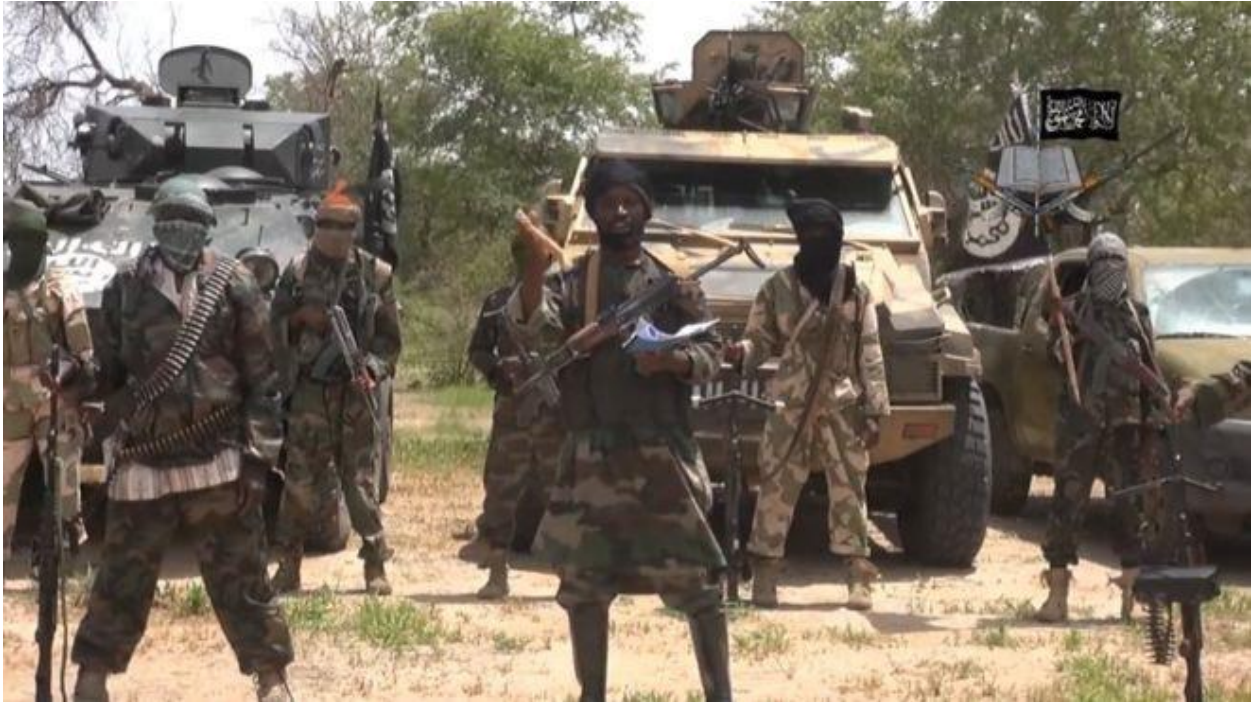
Boko Haram, date unknown (BBC, 2016)

displaying discipline, fraternity and strong leadership. Poised, with weapons in hand and ready to fight, their bodies are active and capable of enacting violence on the world. They succeed in embodying the trope of the rebel warrior and project a formidable image capable of instilling fear in the audience.