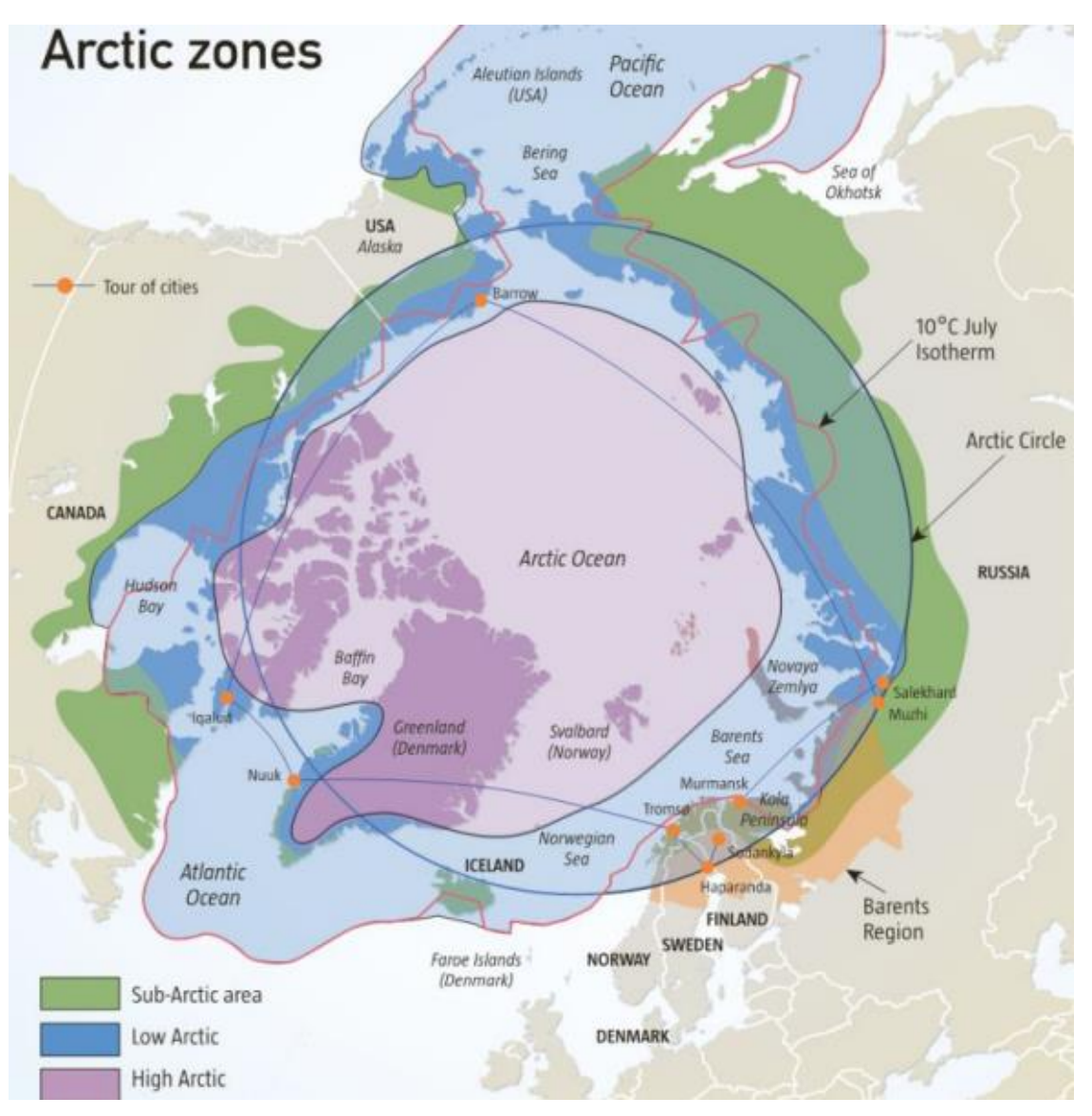
Map by Mika Launis (In Heikkilä & Laukkanen (2013: 10) The Arctic Calls – Finland, The European Union and the Arctic Region. Europe Information of the Ministry of Foreign Affairs).

Eight states have land domain in the Arctic region, and are thus considered to be Arctic states (Bentzen & Hall 2017: 2). They are situated in the Arctic region that consists of the North Pole and its surroundings as well as "the north of the Arctic Circle (latitude 66 degrees<sup>21</sup>, 32 minutes North)" (ibid.). The coastal states of the Arctic differ from the Arctic states most importantly when it comes to land claims in the Arctic Ocean. Canada, Russia, the US, Norway and Denmark together with Greenland are Arctic coastal