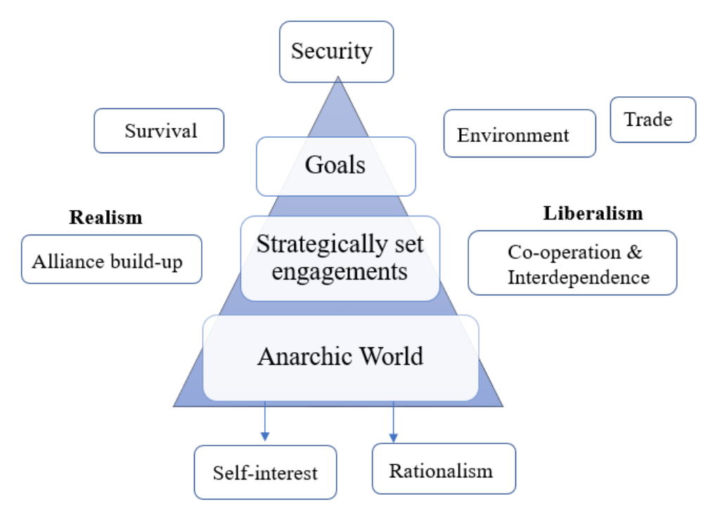
Figure 4. Similarities and differences between neorealism and neoliberalism. The lowest level of the figure, the structure of the system, is anarchic according to both theories. Both also see the actors as rationalistic and self-interest oriented. Moreover, they agree that security is an important end-goal. Which path of strategic engagement (strategic alliance build-up/engaging in international institutions) the state chooses, depends on its world view, as well as its understanding of both its own capabilities and the security environment around it. (Figure my own.)

Finland's perception on the altered security environment is clear, as is her desire of strengthening the EU's role as a respectable security provider. Whilst the EU's current defense capabilities remain inadequate, the author reasons that the EU's civilian powers and presence in the region can be seen beneficial to Finland in terms of promoting the over-all European values<sup>50</sup> in the Arctic region. It is apparent however that Finland strives to increase the EU's defense capabilities and thus wishes the EU to eventually develop into an actual security provider.