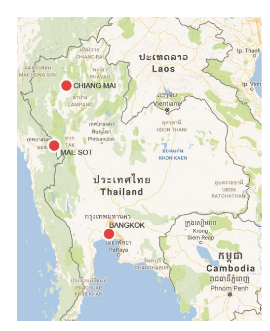
Map 1: Overview of Thailand.

Mae Sot is located in Tak province in northwestern Thailand, 490 kilometers from Bangkok. It has developed from a blank space on colonial maps, to a shady black market-hub, to the rapidly growing and industrializing boomtown it is today. It has been described as a 'little Burma' – a label which does