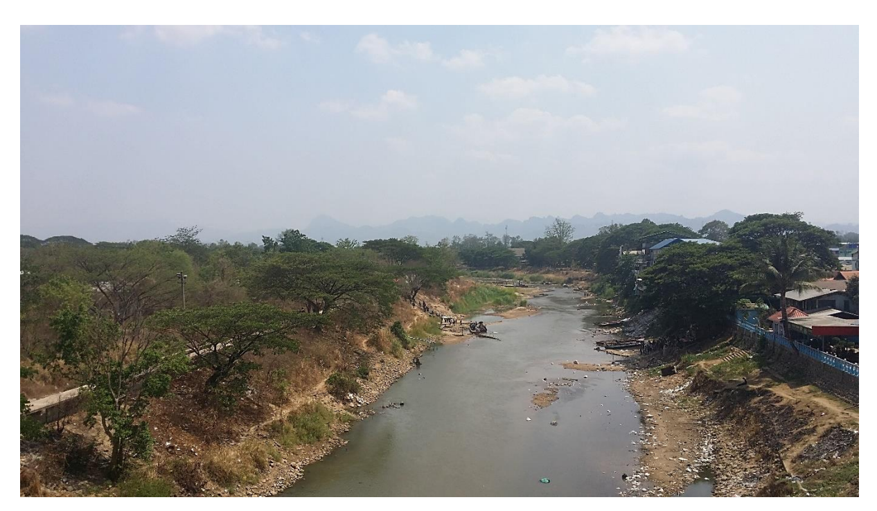
Photo 1: The Moei River as seen from the Friendship Bridge. Thailand to the left and Myanmar to the right.