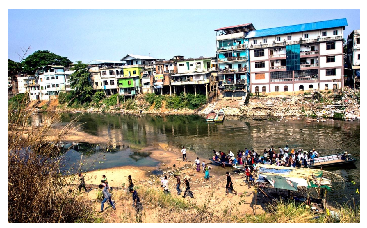
Photo 4: Entering Thailand 'the sneaky way'. Passengers crossing into Mae Sot by a boat from the Myawaddy-side.

There are, of course, many other ways of crossing the border – both for those with good intentions and for those with more dubious agendas. Several organizations active in the region would explain to me how they almost exclusively worked in Myanmar, but that they rarely would cross the border – in an authorized manner, that is. There was talk of "extra-legal crossings" and having "understandings with the authorities". Reoccurring in these stories was not the fact that the authorities on either side of the border were unaware of this movement, but rather that they did know. "It's really all about saving face", a humanitarian worker explained to me. Through communicating with the border guards, they eased the chance of any state officials 'losing face' through being revealed to not know what takes place at the border. Again comes the power of willfully looking away. The issue was not whether or not the authorities were able to stop the border movements, but rather that they possess the knowledge of it taking place, in theory meaning that they could intercept if they so wished.