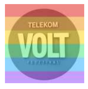
Figure 3. Rainbow festival logo

VOLT festival has changed the official profile picture on the Facebook page to a modified logo in rainbow design to express their opinion and support for the cause of homosexuality. It generated a very intense debate as many VOLT visitors reject and want to exclude the homosexuals from the festival.