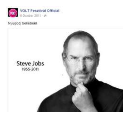
Figure 2. Steve Jobs' memorial post VOLT festival, 6<sup>th</sup> of October ,2011

The commemorating post of Steve Jobs posted on the Hungarian National Day.