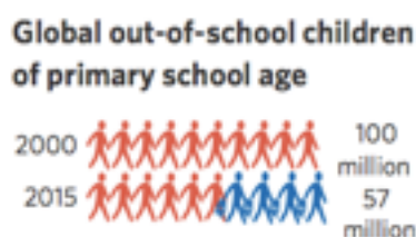
Table 3: Global out-of-school children of primary school age

Since 2000, considerable progress has been made worldwide, specially in improving overall school enrolment (UNESCO 2014: 28; UNESCO 2015: I; UN General Assembly 2000: 5; and UN 2015: 2). The primary school net enrolment ratio has increased from 83% in 2000 to 91% in 2015 (UN 2015). The out-of-school number of children has diminished by almost half, from 100 million in 2000, down to 57 million in 2015, as shown in Table 3 (Ibid: 3).